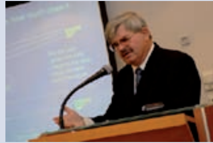
William H. Inmon , “The Father of Data Warehousing”

Bill Inmon, world-renowned expert, speaker and author on data warehousing, is widely recognised as the “father of data warehousing.” He is creator of the Corporate Information Factory and more recently, creator of the Government Information Factory. He has over 35 years of experience in database technology management and data warehouse design, and he is known globally for his seminars on developing data warehouses. He has been a keynote speaker for many major computing association and many industry conferences, seminars, and tradeshow.